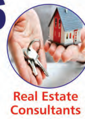
Real Estate Consultants

Deal In: Top City, Mumtaz City, E-12, D-12, B-17